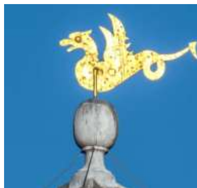
Bossall's wyvern weather vane