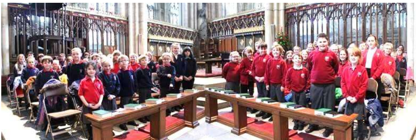
Sand Hutton and Warthill CE Primary Schools singing in the Minster to help celebrate 60 Years of the York and District MS Society.

It has also been important that we have been able to be involved in events which assist the wider community and look beyond the walls of our small school. Two singing opportunities came along that allowed us to do this. Firstly, along with Warthill CE School, we were invited to sing in the Minster as part of the service held to celebrate the 60 th birthday of the York MS Society. We were made to feel very welcome on this very special occasion and the children had an experience that they will remember for a long time.