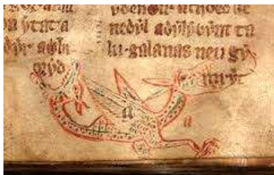
A wyvern in a medieval manuscript

A wyvern is a legendary creature with a dragon's head and wings, a reptilian body, two legs, and a tail.