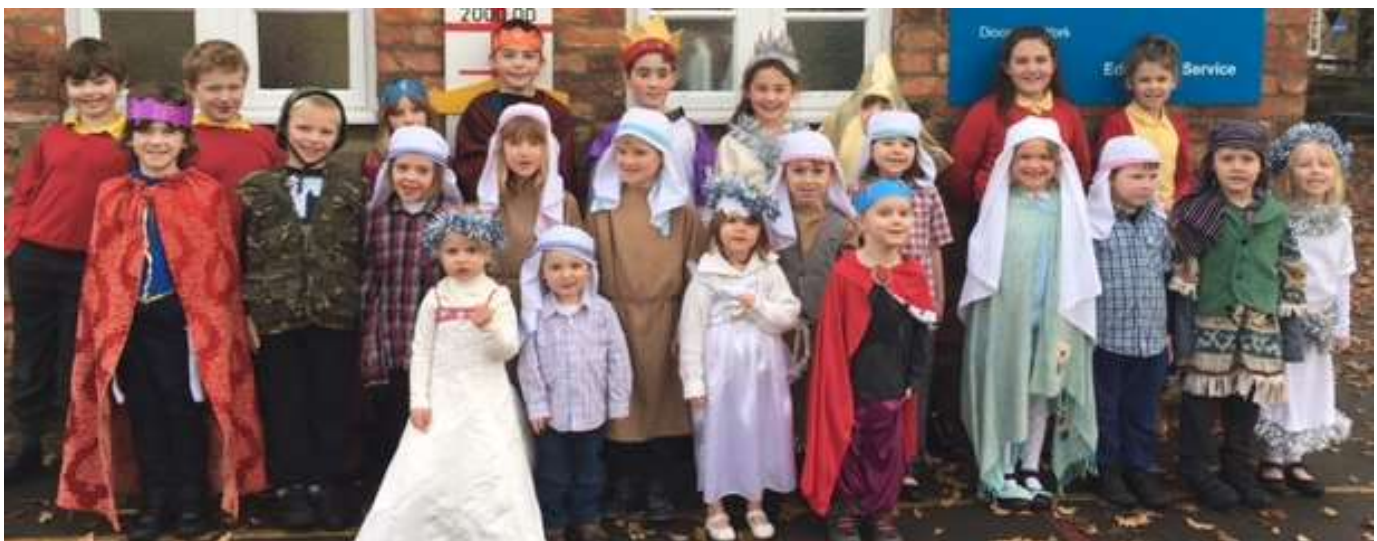
The stars of the Nativity play

The autumn term culminated as usual with many celebrations including our Christmas Party, Christingle Service and a fantastic performance from all the children in both our nativity plays.