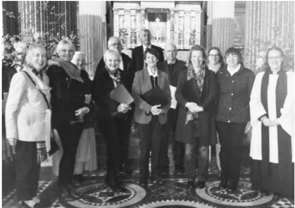
In the chapel at Castle Howard

The Benefice Choir was delighted to be invited to sing Choral Evensong again at Castle Howard on Sunday 7 th May.