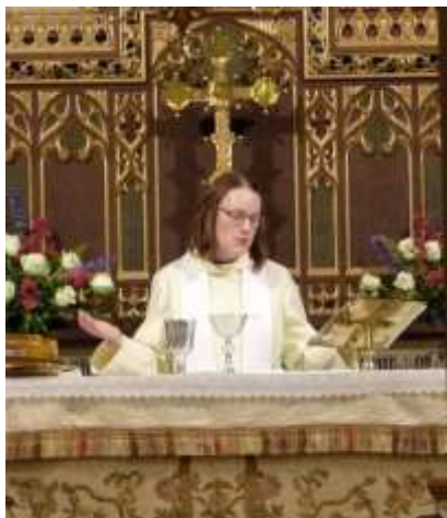
Celebrating communion for the first time at St Mary's, Sand Hutton June 11 th

As she drove home from what her friends described as the best bring and share meal they had ever seen, in Sand Hutton Village Hall, she thanked God for the Benefice of Harton, and for the way its people had welcomed her so warmly. She reflected that she still had a lot to learn; about this community and about being a priest, and all which that entails. And more than anything she wanted to thank everyone who had walked with her on