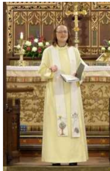
At St Mary's, Sand Hutton