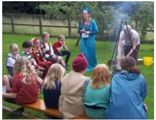
Something's cooking !

and Sand Hutton WI had created a Well Dressing scene which appropriately enough was displayed on top of the well!