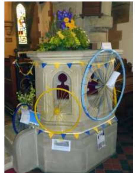
Tour de Yorkshire

The festival weekend required a great deal of hard work both in the preparation and in the implementation, in staging the flower displays, providing food and hospitality, setting up and clearing up. We are very grateful to everyone who took part in any way to make the weekend such a great success. It brought a lot of people together to enjoy themselves socially as well as raising an excellent sum for church funds.