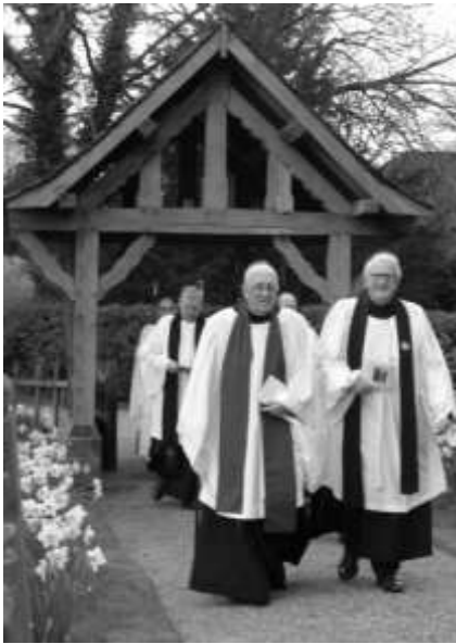
Clergy procession before the service