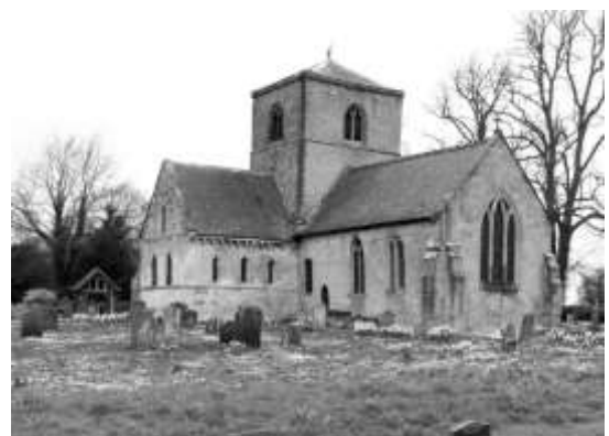
St Botolph's Church, Bossall