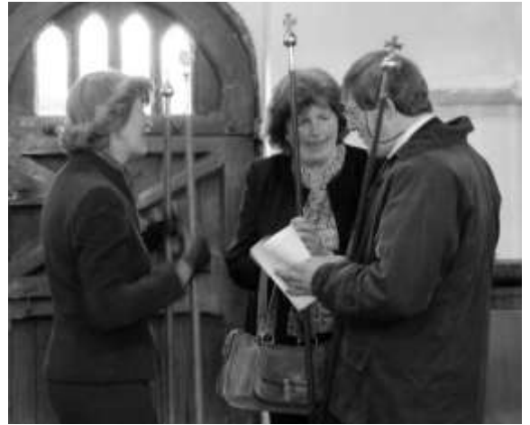
A huddle of churchwardens