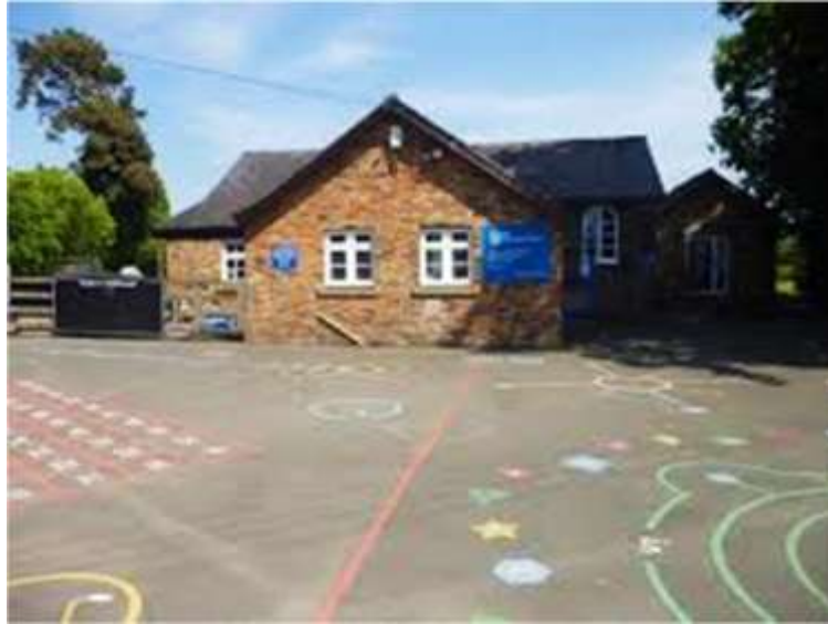
Foston School at Thornton Le Clay

If you have a child due to start nursery or reception please come and join us.