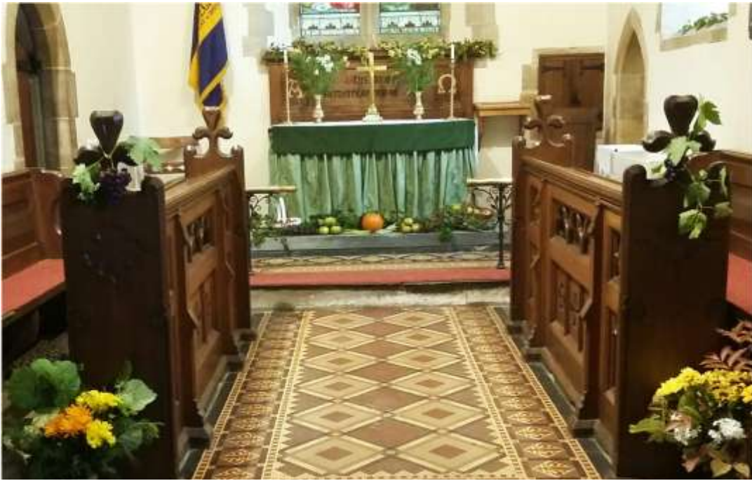
The fruit (and veg) of their labours! All Saints ready for Harvest Festival