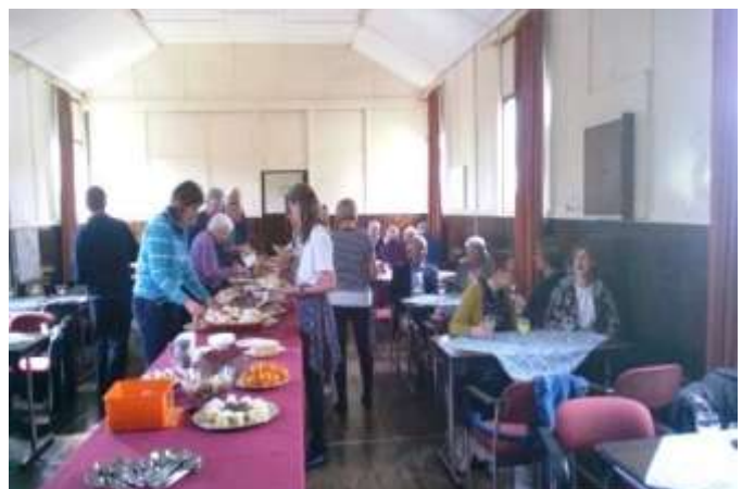
Bring and share lunch