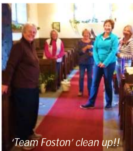
'Team Foston' clean up!!

After a lovely hot summer it was a real pleasure to see our beautiful little church decorated with Harvest produce. A working party of volunteers (Team Foston) were organised and we all set on to dust, polish, scrub and brush All Saints Church. Next we all thoroughly enjoyed decorating the church to make it a worthy place to celebrate Harvest Festival.