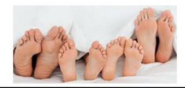
Local to Malton and surrounding area

Fully qualified Fully insured Fully enhanced DBS checked clear