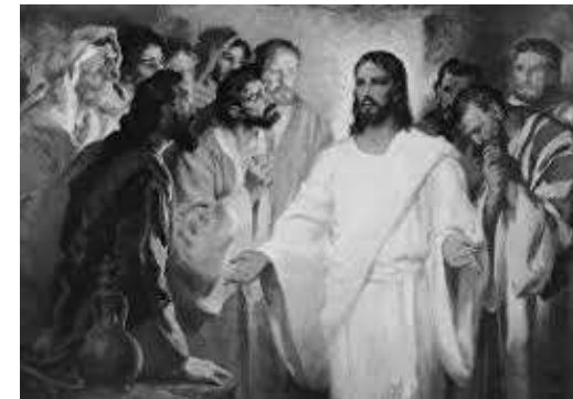
Jesus appears to his disciples in the Upper room after the Crucifixion