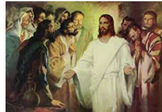
Jesus appears to his disciples in the Upper room after the Crucifixion