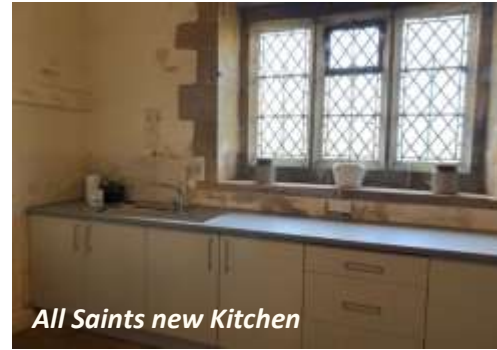
All Saints new Kitchen