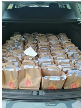
126 bags loaded and ready to go!

Many thanks to all the helpers who volunteered to take the bags around the villages.