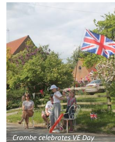
Crambe celebrates VE Day