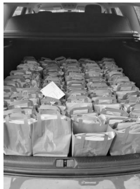
126 bags loaded and ready to go!

Many thanks to all the helpers who volunteered to take the bags around the villages.