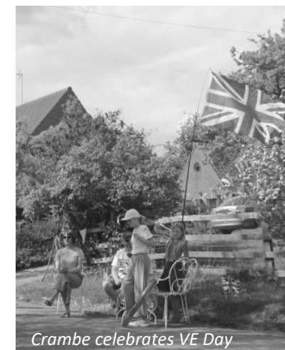
Crambe celebrates VE Day