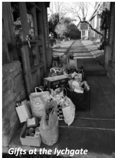
Gifts at the lychgate

Despite the Covid restrictions and lockdowns, we have provided the referred 741 children with Christmas presents and 240 families with additional help with food.