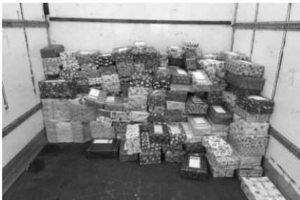
Loaded and ready to go!