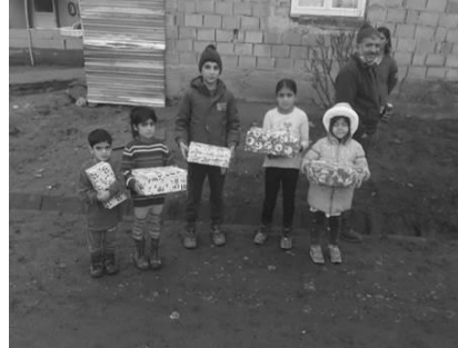
Romanian children with their gifts