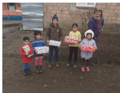
Romanian children with their gifts