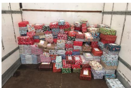
Loaded and ready to go!