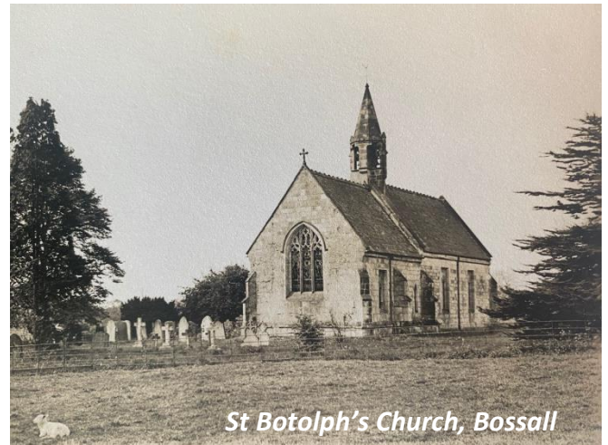
St Botolph's Church, Bossall