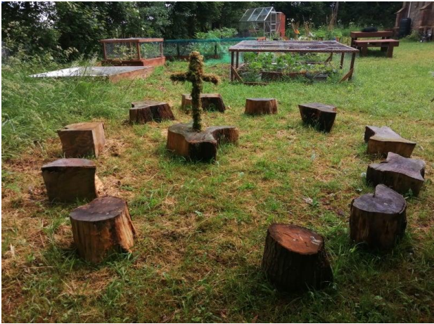
Log slice prayer circle with moss cross