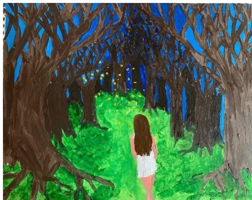
Esther's stunning winning entry