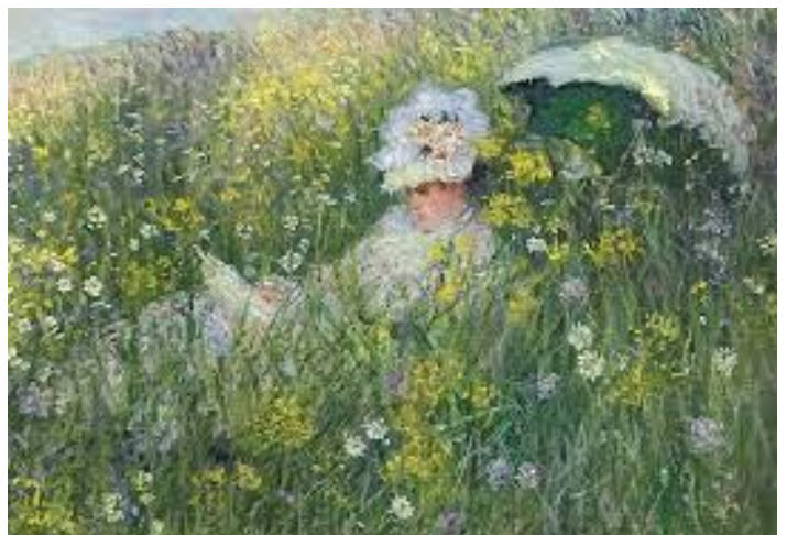
'In the meadow' – Claude Monet

Hello from a very sunny Foston Church! I decided to take inspiration for this contribution to our circular, by sitting in the churchyard. It really is a very beautiful and peaceful place to be. Hopefully as a nation we are taking gentle steps towards a new normal, and we all learn to live with the effects of the pandemic.