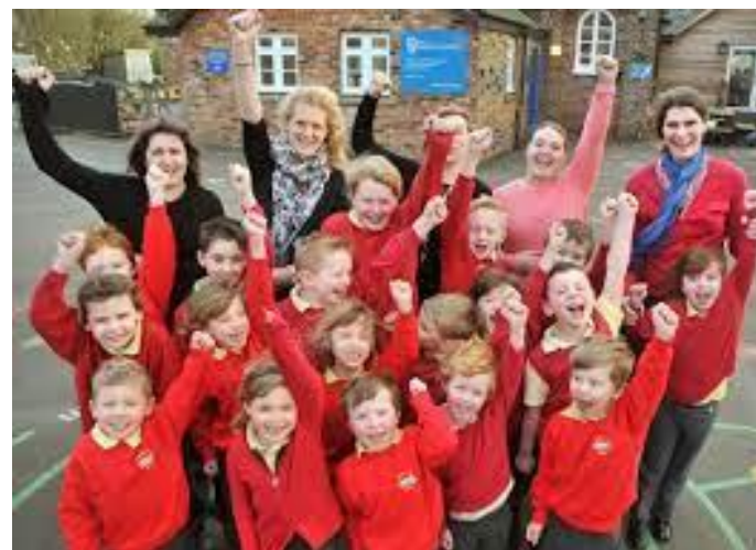
Gazette and Herald

Please get in touch on fostonoffice@foston.n-yorks.sch.uk if you would like to visit our school to see what we have to offer in our flourishing Early Years Setting.