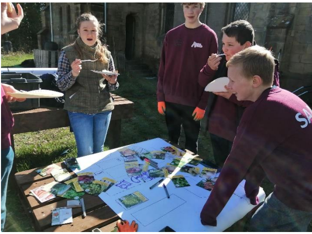
The Aubergines at work!