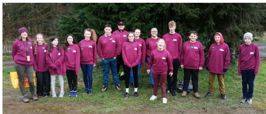
The Aubergine Operations sport their new sweatshirts

I would like to begin by extending a huge 'Thank you' to all the volunteer helpers who so generously give of their time to support me in running Benefice Children and Family events. Without their kindness we would not be able to hold all the different activities. Their valuable input does not go unnoticed.